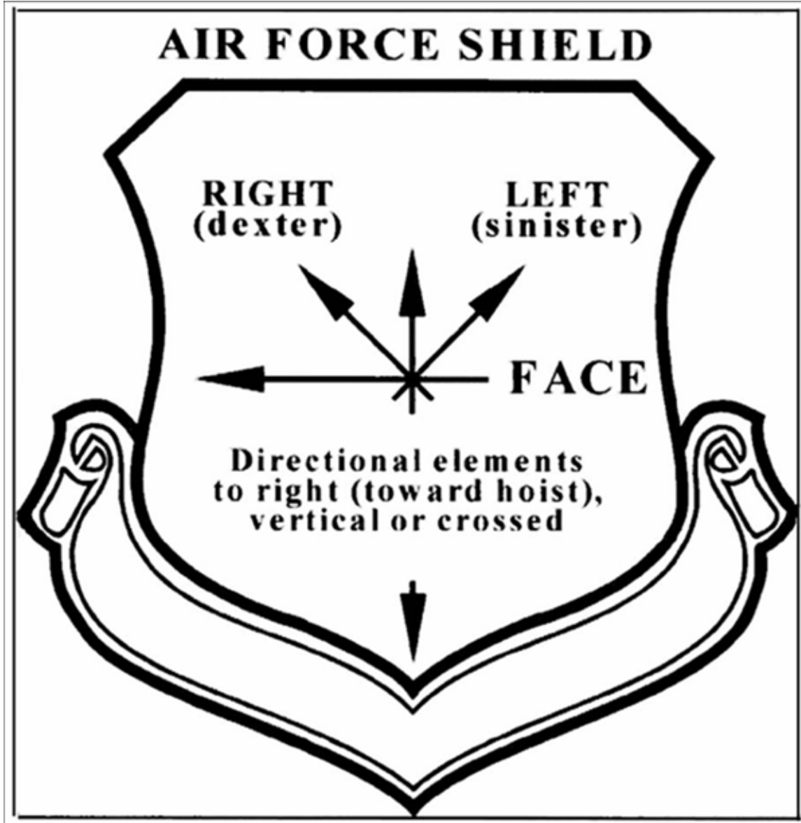
Figure 3.1. Shield Design Format used for Emblem of Groups and Above (Flag Bearing Units).